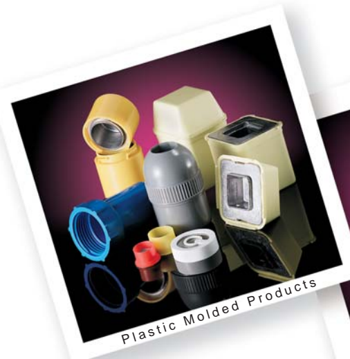
Plastic Molded Products